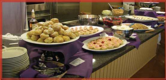
Grand Dessert Buffet add $3.00/person We will prepare and serve a selection of desserts from the choices listed above.

Several varieties available — just ask for your favorite.